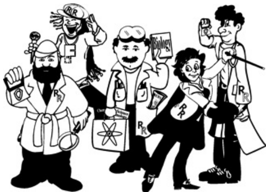
Figure 1. The Reading Rangers: (left to right) Inference Investigator, Funky the Fiction Freestyler, Nando the Non-Fiction Know-It-All, The Great Picturini, and Just-the-Text-Rex.

A set of five lively, culturally diverse characters was developed, each depicting or personifying a reading strategy or literature concept. The entire group of characters was labeled the “Reading Rangers.” The Reading Rangers are cast as reading “experts” and figure prominently in the curriculum. They are the main characters in the curriculum read-aloud books that were created (described in the following section) and 30 inch stand-up versions of the Reading Rangers were brought to the classroom and selectively introduced to children during the appropriate lessons. The Reading Rangers are: The Great Picturini , the Inference Investigator , Just the Text Rex , Nando the Non-Fiction Know-It-All , and Funky the Fiction Freestyler . They are pictured in Figure 1.