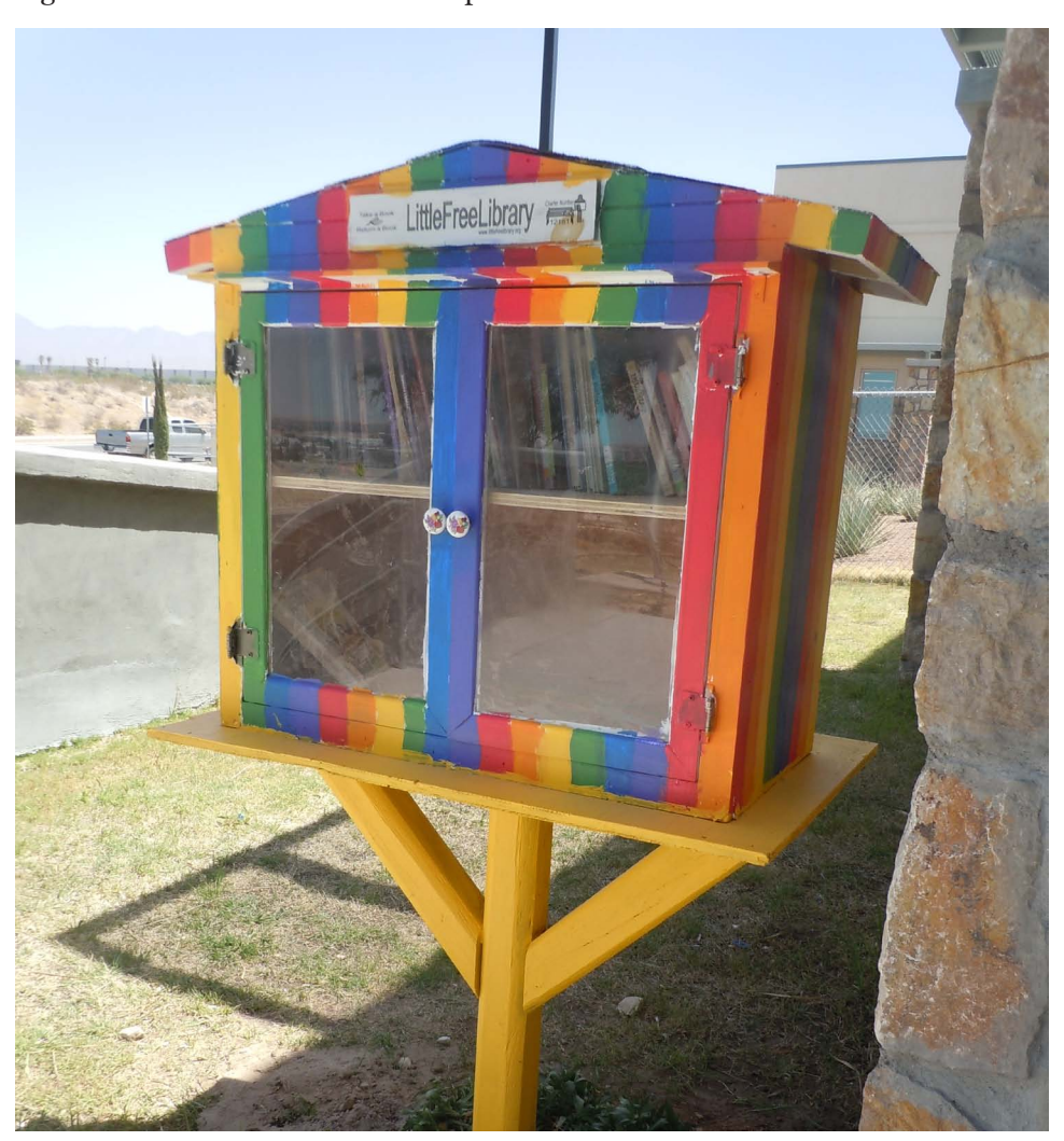
Figure 2. The Little Free Library welcomes patrons and prospective readers of all ages.

Even before I enter the school, the outdoor Little Free Library is alive with movement and conversation between students and their parents. A book talk is occurring en vivo , in real life. The Little Free Library consists of a wooden box full of donated and exchanged books. The library circulates on the honor code regardless of the book borrower's zip code and income level.