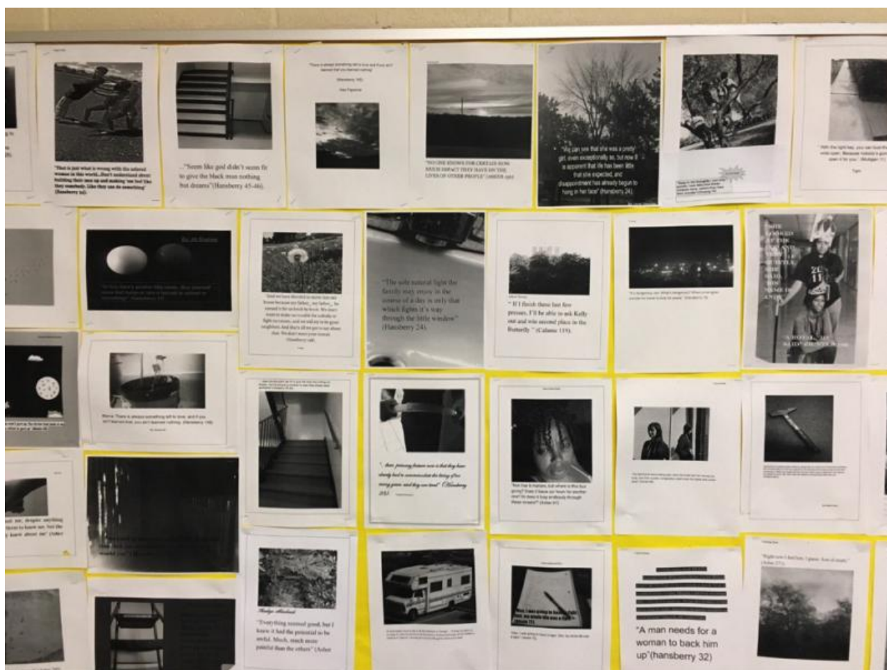
Figure 3: Completed PhotoVoice Projects