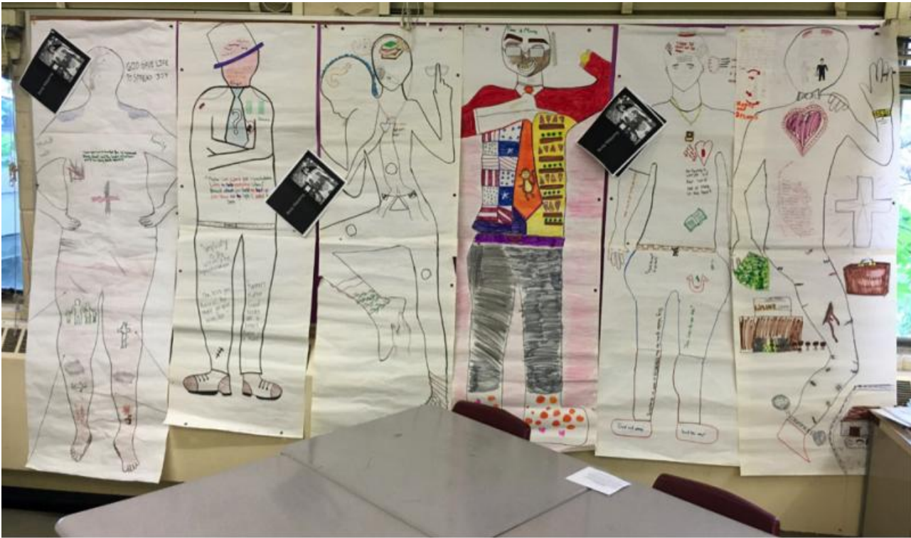
Figure 1: Completed Body Maps

Through Body Maps, students created visual interpretations of characters' experiences with discrimination based on race, gender, age, and socio-economic status. My collaborating teacher and I then conferenced with students to discuss what symbols students chose to use to interpret their assigned characters' onto Body Maps, and to go over what connections they made between their characters' lived experiences, and the ways that these issues manifest in society today. The Body Maps acted as an initial tool to help students become critically conscious of the characters' experiences with discrimination by mapping them out using symbols.